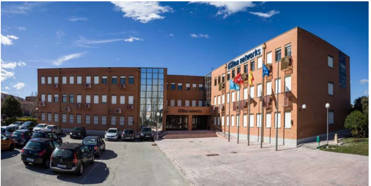
Entrance and parking of IMDEA Networks' building at Avenida del Mar Mediterraneo, 22 – Leganes (Madrid)

* TICKETS: MetroMadrid and Cercanias are different Railway Network Systems. Thus, you will need to purchase a single ticket named “Sencillo+Suplemento Aeropuerto” which will allow you to use the MetroMadrid Network from the Airport to “Nuevos Ministerios”. From there you will need to purchase a Cercanias single ticket or “Billete Sencillo” to “Leganes Central” station. More information: https://www.metromadrid.es/es/viaja_en_metro/tarifas/billetes/