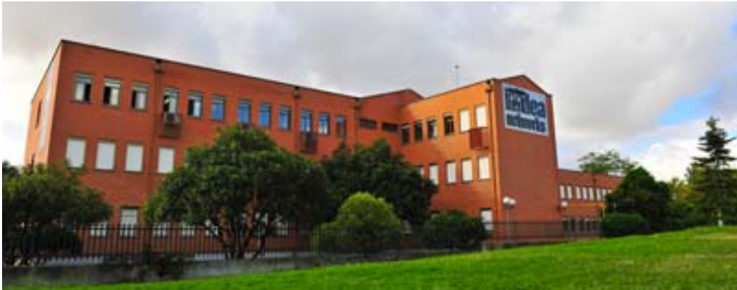
Back view of IMDEA Networks' building (seen from Avenida de America Latina)